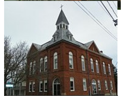
National Register of Historic Places