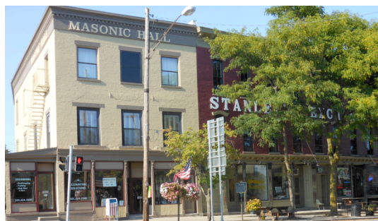
Two Main Street views August 2012

Our society's historic files and photo collections proved very important in restoring building facades and creating the content of the historic signs. Thank you to New York State, our Village officials, and all of the building owners, as well as the many other citizens who helped make this project a success. It was a community effort!