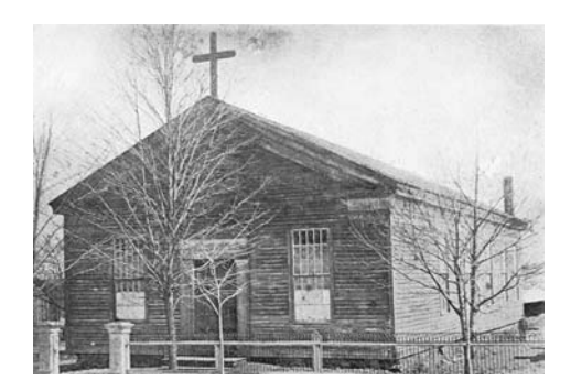
St. Rose Church Built in 1849