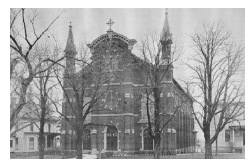
St. Rose Church Dedicated in 1873