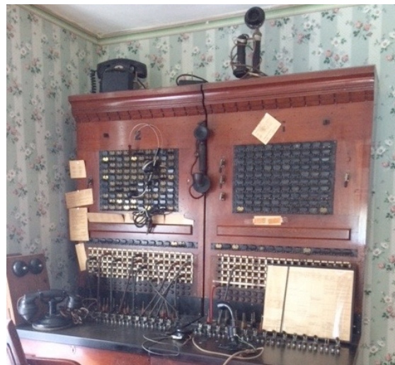
Old switchboard is now at the Tennie Burton Museum. Come, see it for yourself, and maybe even take a selfie.

About 1910, the Federal or Home Telephone Company placed a switchboard in the Allen Block on Rochester Street...and both systems were in operation until 1918 when a consolidation of the two systems into the Rochester Telephone Corporation took place, and all telephone service was centralized in the Main Street location. Also about 1910, the equipment was taken from the store and placed in a room directly over it on the second floor, where it remained with two other switchboards installed later, to serve a greatly increased list of subscribers.