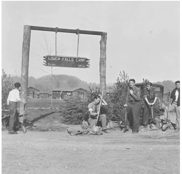
CCC enrollees work to plant evergreens near the gate of Camp 49 at the Lower Falls in 1936. They and other young men would plant thousands of trees and build miles of roadways, cabin areas, shelters, walls and more over the eight years the four CCC camps operated in the Park.