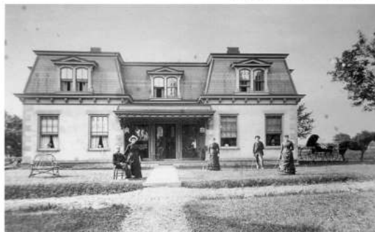
Presented by the Lima Historical Society