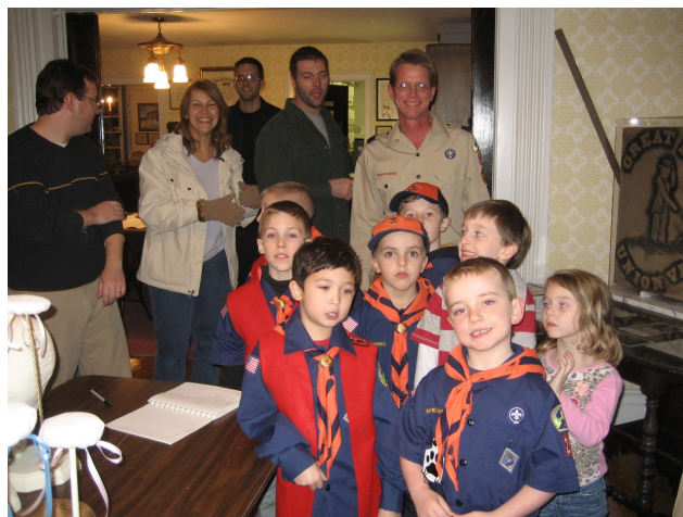
Lima Cub Scouts and their leaders and families visiting the Tennie Burton Museum. Favorite Attraction?? THE FINGERS!

The commission's goals include: providing historical and archaeological information to Town and Village Boards as they deal with planning and SEQR processes; assisting Town and Village officials in securing municipal grants relating to preservation of Lima's historic structures; and offering a series of public educational programs showing the advantages of preserving Lima's architectural heritage.