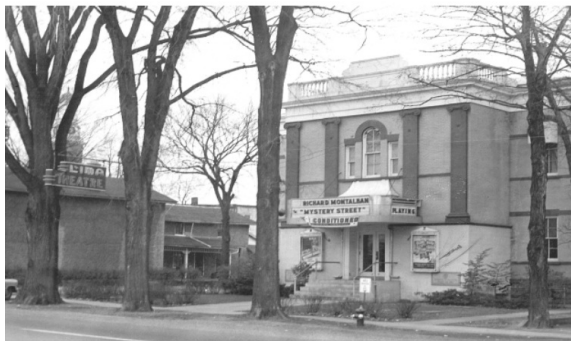
Presented by the Lima Historical Society