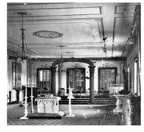
Interior of Masonic Lodge, from Around Lima

Please spread the word to family and friends.