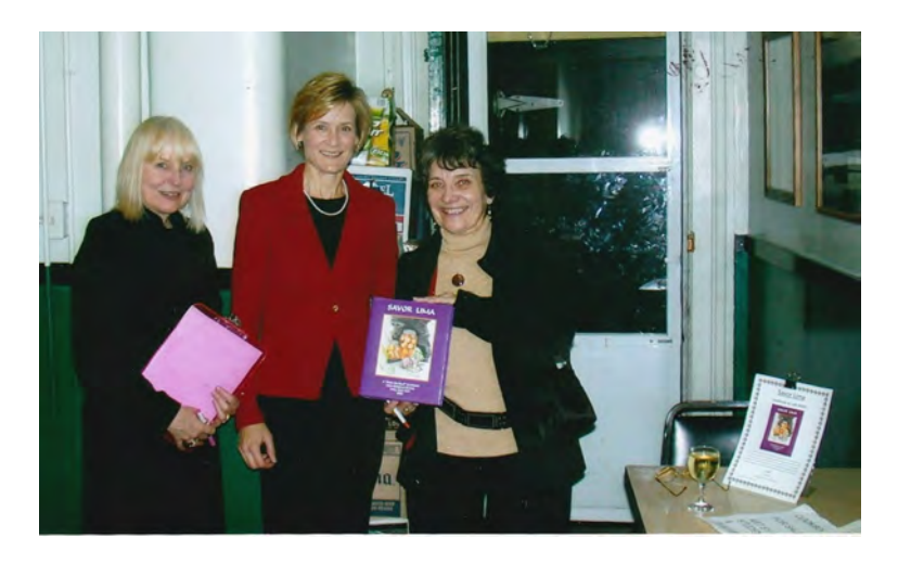
2008 Savor Lima's Harvest Progressive Dinner 1984 façade drawings exhibited at Town Hall Savor Lima Cookbook published