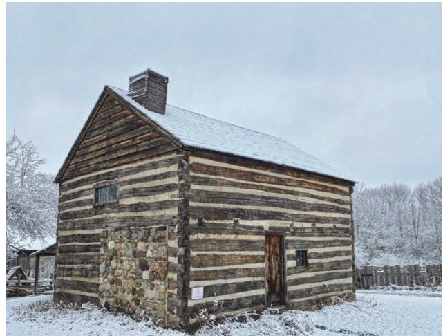
Hetchler House, Genesee Country Village & Museum. Typical of early Euroamerican dwellings in the Genesee Valley